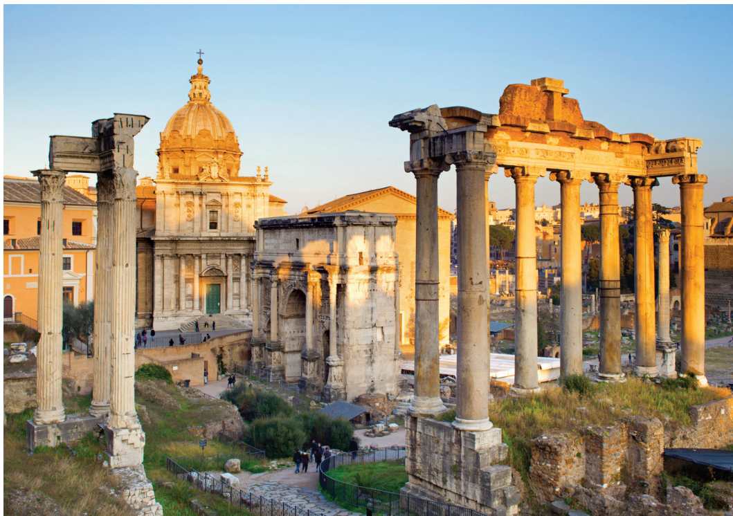
The Roman Forum dates to the 7 th century BCE.

building; tossing a coin into Trevi Fountain; or visiting any number of renowned museums and churches. B