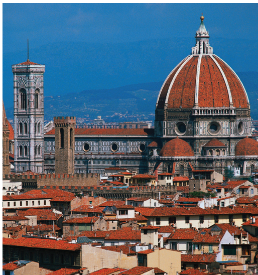
We visit splendid Florence on Day 12.