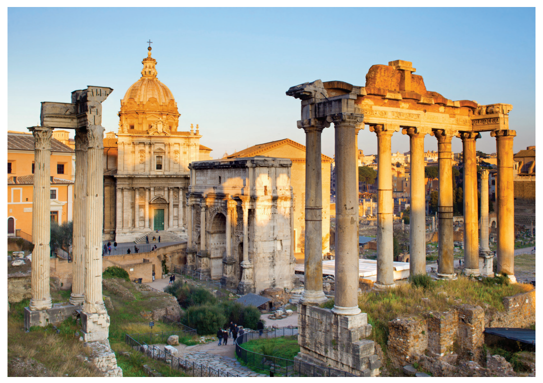
The Roman Forum dates to the 7th century BCE.

building; tossing a coin into Trevi Fountain; or visiting any number of renowned museums and churches. B