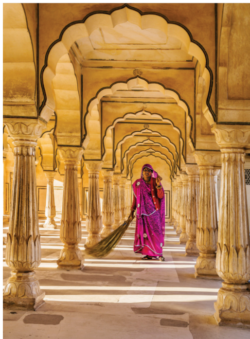
Amber Fort, former Rajput capital

Day 15: Varanasi Early this morning we return to the Ganges where Hindu pilgrims perform their rituals along the ghats (steps) leading to the river. We visit several ghats by boat as we experience for ourselves the spiritual aura of the hallowed Ganges waters. Then we return to our hotel with time to rest before this afternoon’s walking tour and private performance of classical sitar. Tonight we celebrate our journey at a farewell dinner at our hotel. B,D