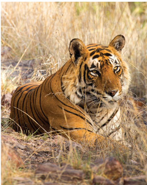
Bengal tiger rests in Ranthambore.

Day 16: Varanasi/Delhi We fly this afternoon to Delhi, where the evening is at leisure. B