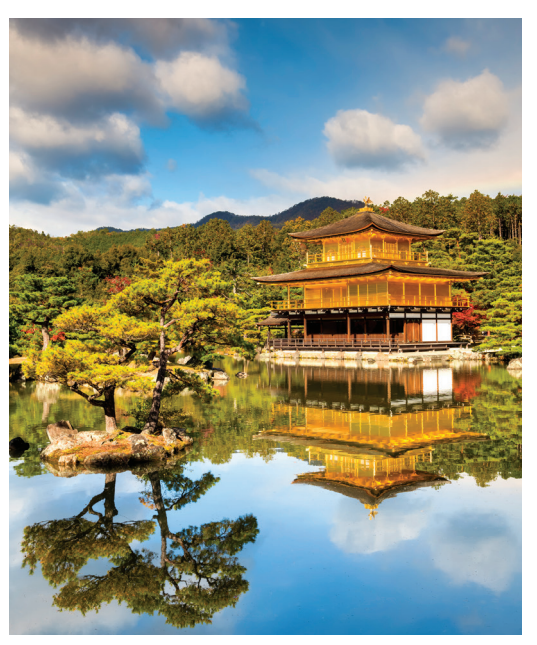
Kyoto's Heian-jingu Shrine