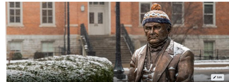
Purdue Alumni Club Leaders