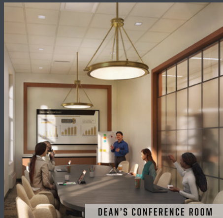
DEAN'S CONFERENCE ROOM